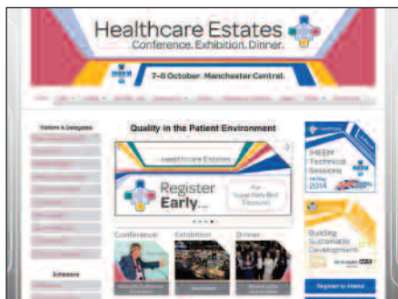
The new-look website.