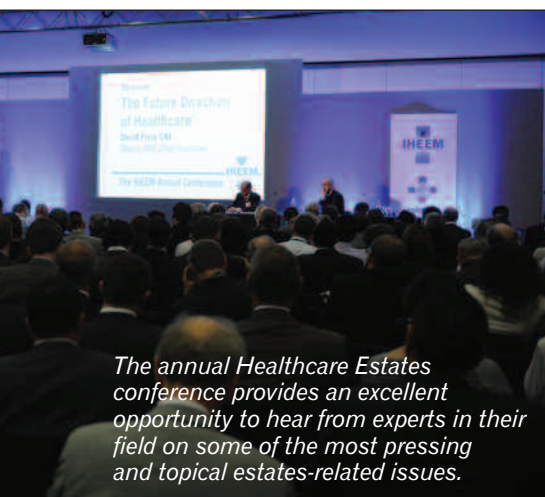
The annual Healthcare Estates conference provides an excellent opportunity to hear from experts in their field on some of the most pressing and topical estates-related issues.