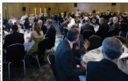
The Annual Conference Dinner in full swing in Manchester last year.

For the latest information, more on the Awards' history, and the terms and conditions, visit the IHEEM website: www.iheem.org.uk/awards