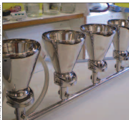
Apparatus for water testing in a hospital microbiology laboratory.