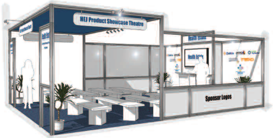
The HEJ Product Theatre; one of four theatres set for the exhibition floor this year.

The BRE, the independent, research-based consultancy and certification organisation for the built environment, will focus, in