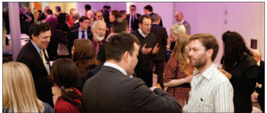
Guests at the Royal London Hospital event discuss sustainability within the NHS.

departments have volunteered to be 'carbon champions'. As part of this, on NHS Sustainability Day we will launch our staff pledge to encourage all staff to think about where they could be doing more, as well as providing our Carbon Reduction Handbook for our personnel to see what we have already done.