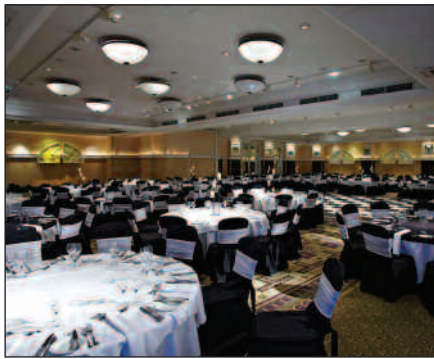
The Alexandra Suite at the Manchester Midland Hotel will be the venue for the 2013 IHEEM Annual Dinner and Awards.